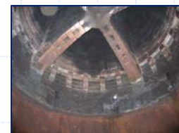
Refractory (after 10 years)

The 2ST-3.6 gasifier has been proven to operate continuously with the only required maintenance being to external mechanical components. Auxiliary vessels and mechanical equipment are also designed for ease in maintenance and reliability.