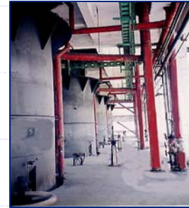
5 Gasifier Installation (4 shown)

To allow for overhaul periods and emergency shut downs, provision is made for spare gasifier capacity to be installed at each plant.